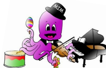
MIM Proprietary Materials